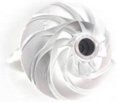
high efficiency single stage compressor