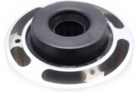
Stator potting with extruded cooling jacket