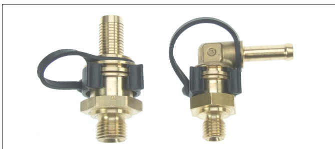
Fig. 4: Retaining clips locked