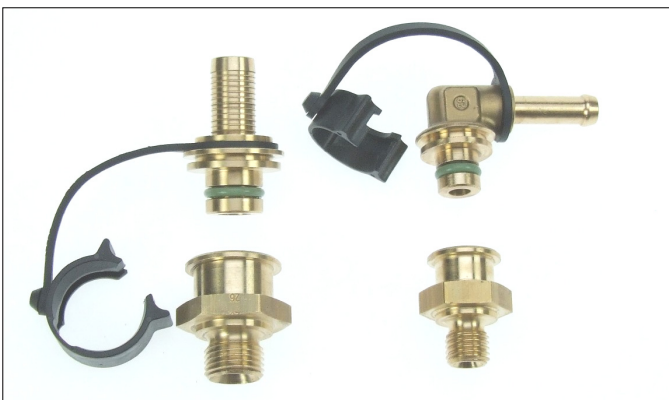
Fig. 6: Plugs disassembled