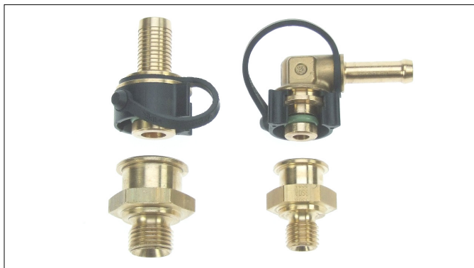
Fig. 3: Plugs and adapters in the initial position