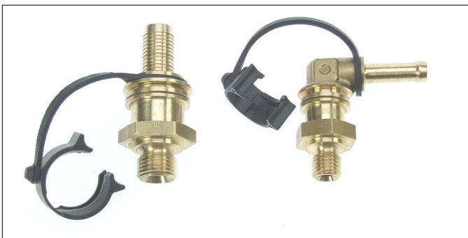
Fig. 5: Retaining clips removed