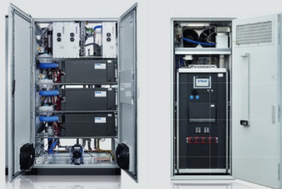
Examples of stationary applications equipped with the PM Module S5 / S8

The heart of the Proton Motor technology is the stack module, which is adapted to the power range. It is specially developed and manufactured by Proton Motor. In addition to the stack module, the fuel cell system already contains supply units for hydrogen and reaction air and a primary cooling circuit. The fuel cell system has a modular structure and can be interconnected to achieve higher performance. It is flexible and adaptable to multiple applications as well as reliable and predictable thanks to PM's all-round services. Individual customer applications and exclusive system requests can be fulfilled.