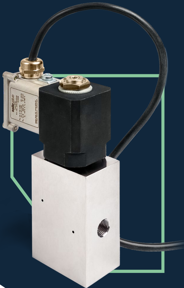
HyValve 1000, Type 3106

We aim to be your partner in building a hydrogen economy. For your peace of mind, our hydrogen valves were honed for long maintenance periods and easy serviceability. Our HyValve range will convince you by its high repeatability, utmost safety and exceptional reliability.