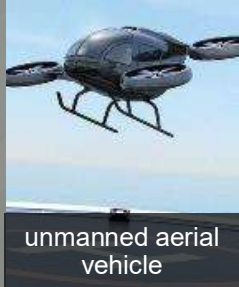
unmanned aerial vehicle